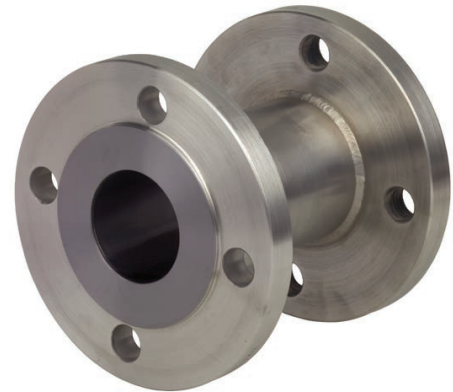
In-line diaphragm seal for flange connection, model 981.27

Pressure gauge or transmitter directly welded, process pressure transmitter with threaded adapter